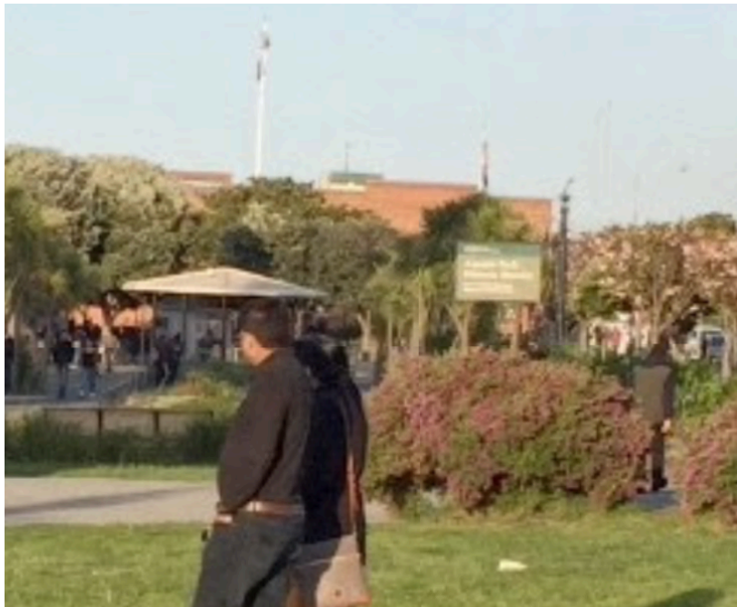
Today's location of Sign

I believe this is the Aquatic Park sign, located at the center of the park, at the end of the Victorian garden.