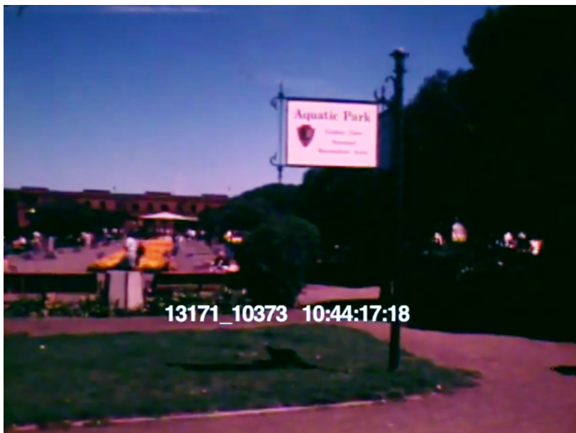
Sign in the same location as seen in this 1979 home movie footage